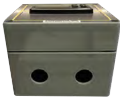
Holes for conduit connections

Box can be supplied in any of the three configurations below: