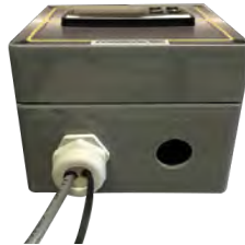
Supplied with cord grip for sensor and valve wire