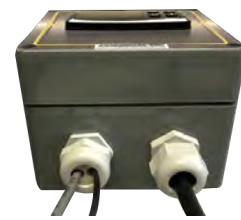
Cord grips for power, sensor and valve wiring